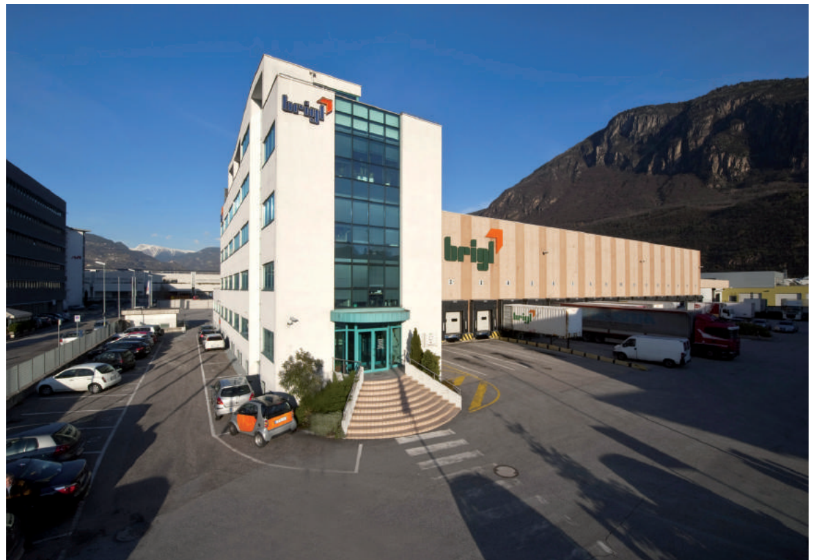
Brigl's headquarters in Bolzano. The business, founded in 1925, offers a complete range of transport (packaged cargo, partial or complete loads) throughout Italy and Europe. It also works in the international shipping division (via sea and air) as well as customs services and integrated logistics

70% The percentage of Brigl's revenues deriving from transport activities. 30%: logistics.