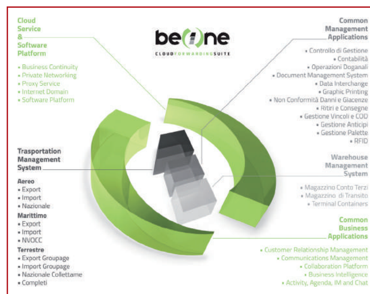
Summary of the features of the BeOne solution