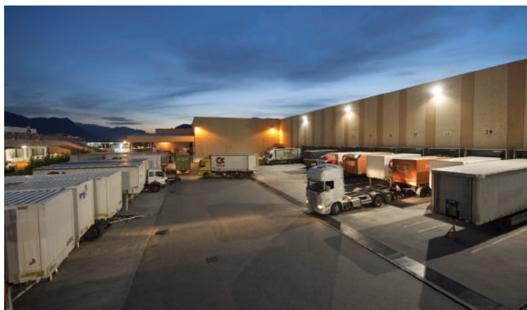
Brigl has a turnover of around 18 million euros and employs 61 people. Its international reach led it join consortia such as Car-goLine, CDS and Palletways